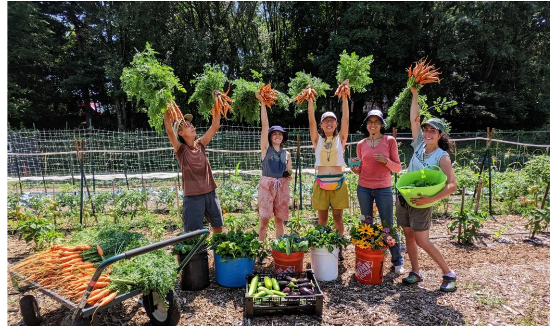
Queens Botanical Garden

Final reports, including evaluations, photos, and expenses will be due February 1, 2025.