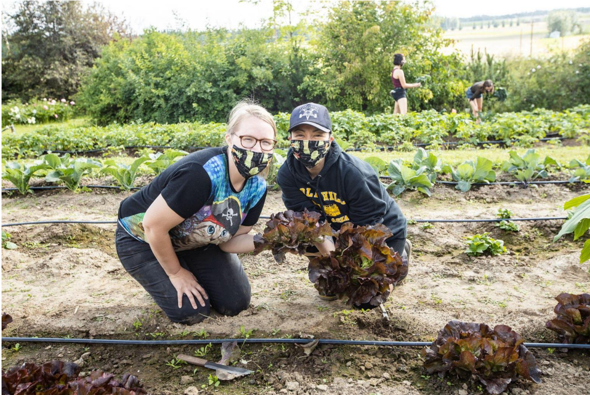
Georgeson Botanical Garden

A public garden is an institution that maintains plants for the purposes of public education and enjoyment, in addition to research, conservation, and higher learning. It must be open to the public and the garden's resources and accommodations must be made to all visitors.