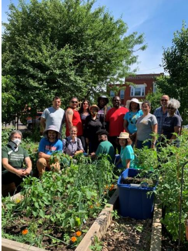
Garfield Park Conservatory