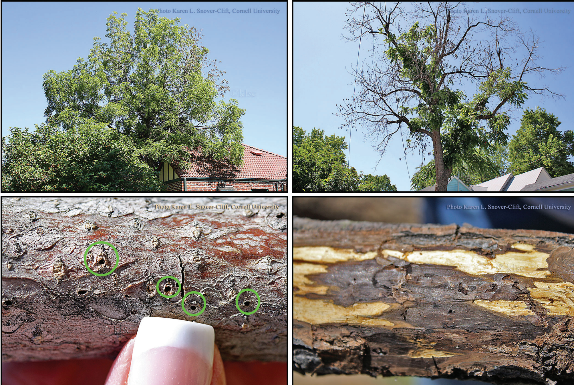
Clockwise from top left: early flagging symptoms on Juglans nigra . Juglans nigra showing more advanced dieback. Bark removed showing walnut twig beetle galleries and coalescing cankers. Juglans nigra branch with walnut twig beetle entrance and exit holes.