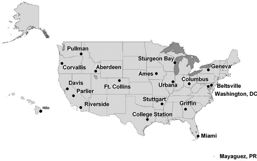
Fig. 1. Map of USDA-ARS National Plant Germplasm System collection genebanks.

valued as specific cultivars or genotypes must be propagated and distributed as cuttings, scionwood for grafting, in vitro cultures, whole plants, roots, bulbs, rhizomes, or corms. Some accessions within “clonal” collections, particularly those of wild origin, may be maintained and distributed as seeds because they are valued for the genes they possess, rather than for their specific genotypes.